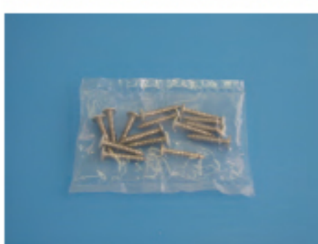
UBTPA3.5X20S INSTALLATION SCREW SET