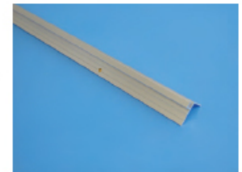
N2597 LOW BOTTOM RAIL