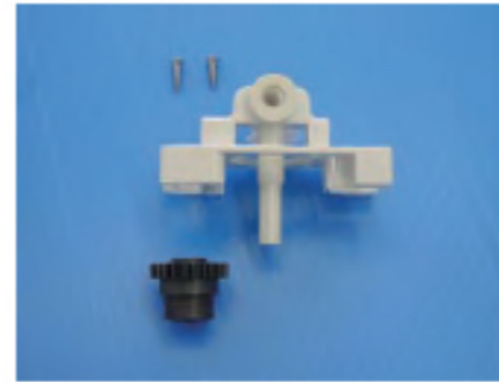
QC03-001S UPPER HOUSING ASSEMBLY