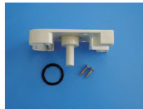
QC03-002 LOWER HOUSING ASSEMBLY