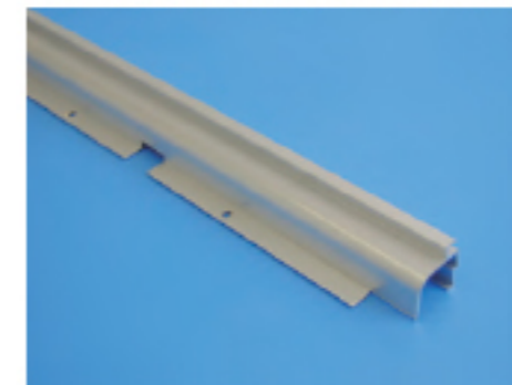
N2598 HIGH BOTTOM RAIL