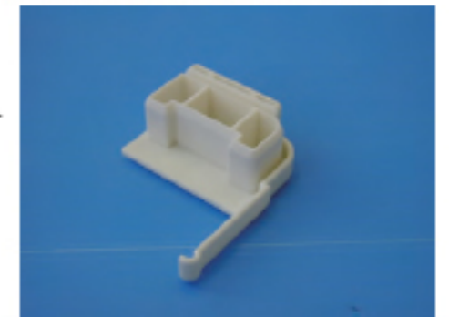
QC03-012 END CAP, RIGHT