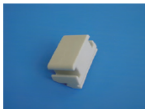
QC03-010 BOTTOM RAIL GUIDE