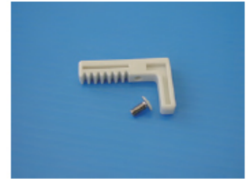
QC03-004S TENSION GEAR BRACKET & SCREW KIT